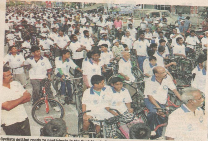
Cyclists getting ready to participate in the Cyclothon in Guntur city on Sunday.