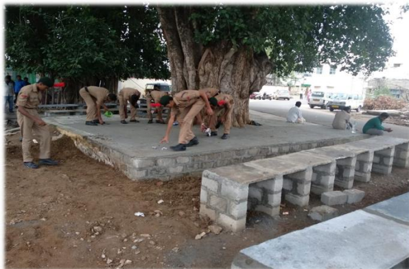
RVR & JC CE, CHOWDAVARAM – 1 (A) ENGR COY NCC, GUNTUR. 26-09-2018 CLEANING OF PUBLIC PLACES - "SWACHHATA HI SEVA"