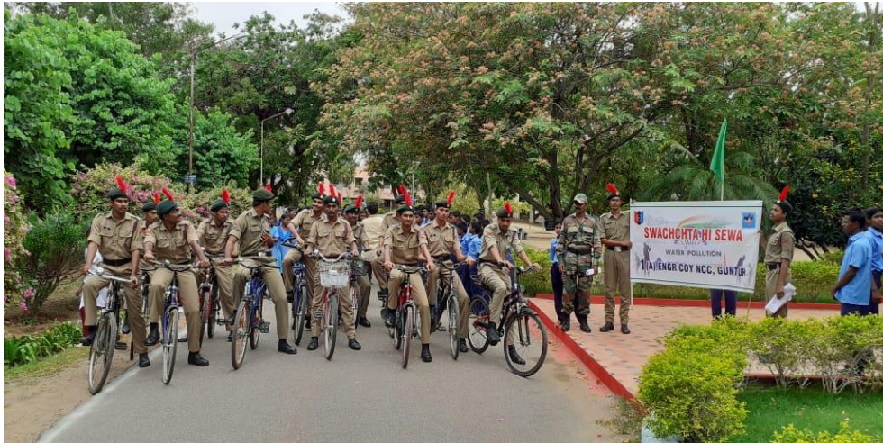
RVR & JC CE, CHOWDAVARAM, - 1 (A) ENGR COY NCC, GUNTUR 03 - 07 - 2019 "CYCLE RALLY TO CREATE AWARENESS ABOUT WATER POLLUTION"