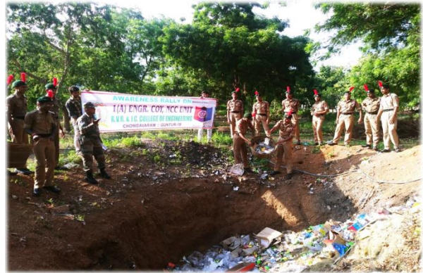
RVR & JC CE, CHOWDAVARAM – 1 (A) ENGR COY NCC, GUNTUR. 24-09-2018 CONSTRUCTING COMPOST PITS - "SWACHHATA HI SEVA"