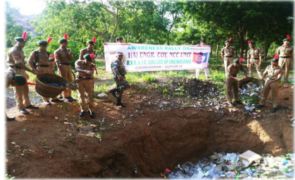
RVR & JC CE, CHOWDAVARAM – 1 (A) ENGR COY NCC, GUNTUR. 24-09-2018 CONSTRUCTING COMPOST PITS - "SWACHHATA HI SEVA"