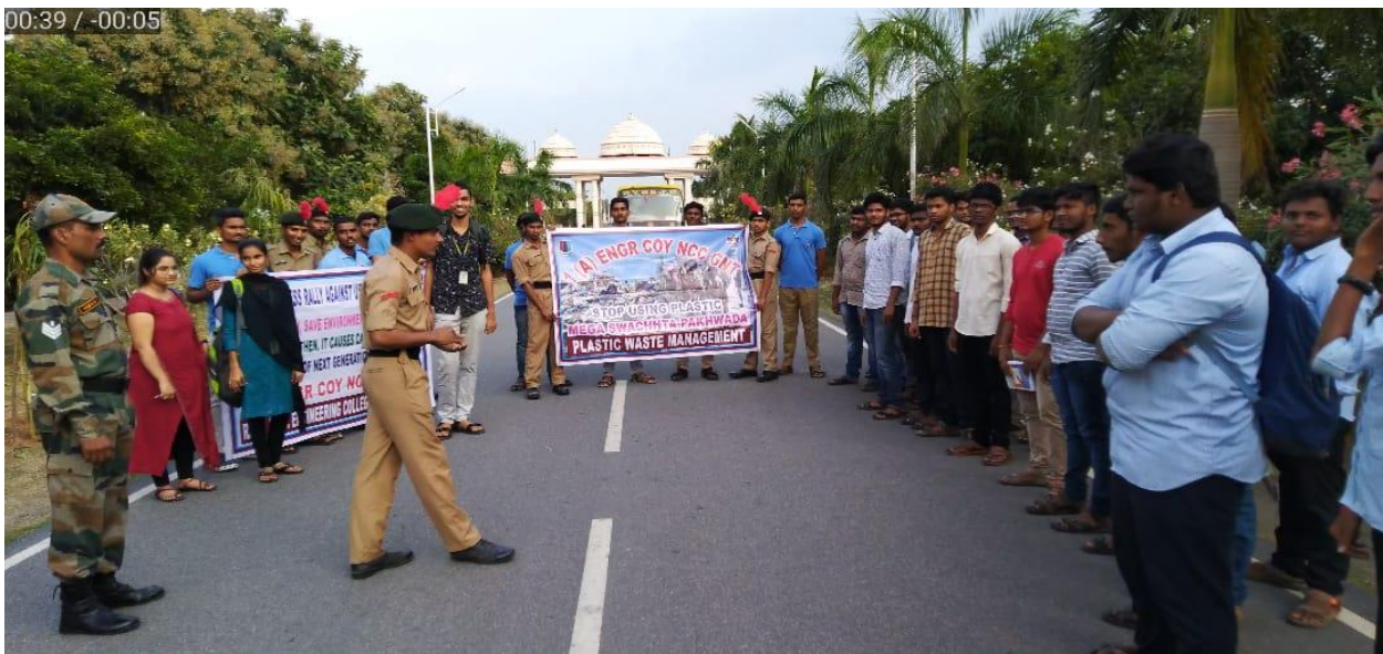
RVR & JC CE, CHOWDAVARAM, - 1 (A) ENGR COY NCC, GUNTUR 30 - 11 - 2019 "MASS AWARENESS RALLY ON PLASTIC WASTE MANAGEMENT"