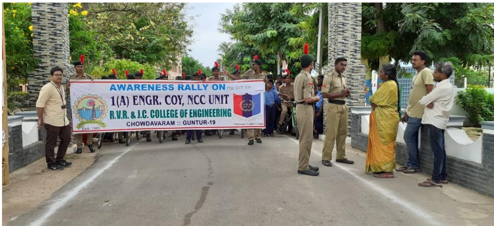
RVR & JC CE, CHOWDAVARAM, - 1 (A) ENGR COY NCC, GUNTUR 08 - 07 - 2019 "RALLY TO CREATE AWARENESS ABOUT AIR, WATER, SOIL AND NOISE POLLUTION"