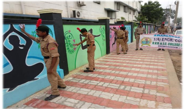
RVR & JC CE, CHOWDAVARAM – 1 (A) ENGR COY NCC, GUNTUR. 22-09-2018 WALL PAINTINGS/CLEANING - "SWACHHATA HI SEVA"