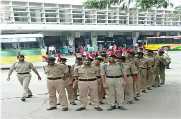
RVR & JC CE, CHOWDAVARAM – 1 (A) ENGR COY NCC, GUNTUR. 23-09-2018 CLEANLINESS DRIVE:BUSSTAND - "SWACHHATA HI SEVA"