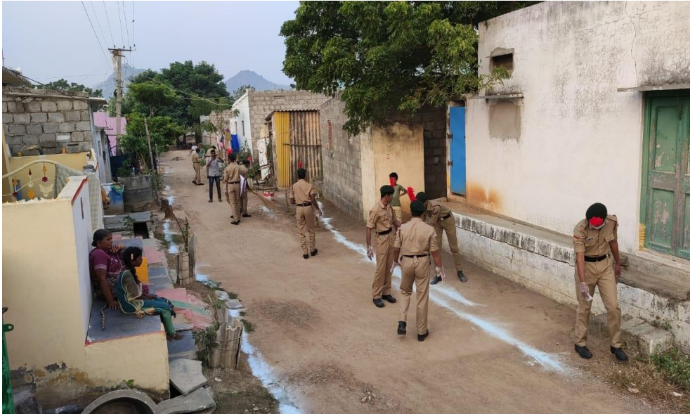
RVR & JC CE, CHOWDAVARAM, 1 (A) ENGR COY NCC, GUNTUR 02 – 11 -2020 “PLOGGING AND AWARENESS RALLY REGARDING NO USE OF PLASTIC”