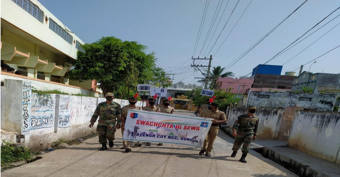
RVR & JC CE, CHOWDAVARAM, - 1 (A) ENGR COY NCC, GUNTUR 24 - 11 - 2019 "RALLY DURING NCC DAY CELEBRATIONS - SWACHHTA HI SEWA"