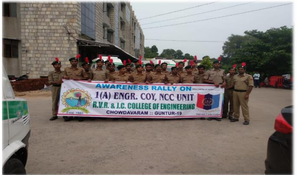
RVR & JC CE, CHOWDAVARAM – 1 (A) ENGR COY NCC, GUNTUR. 30-09-2018,01-10-2018 CLEANING OF HOSPITALS- "SWACHHATA HI SEVA"