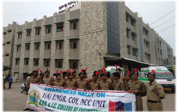
RVR & JC CE, CHOWDAVARAM – 1 (A) ENGR COY NCC, GUNTUR. 30-09-2018,01-10-2018 CLEANING OF HOSPITALS- "SWACHHATA HI SEVA"