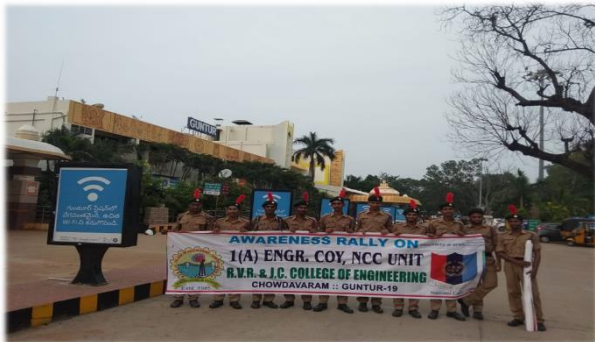
RVR & JC CE, CHOWDAVARAM – 1 (A) ENGR COY NCC, GUNTUR. 23-09-2018 CLEANLINESS DRIVE:RAILWAY STATION - "SWACHHATA HI SEVA"