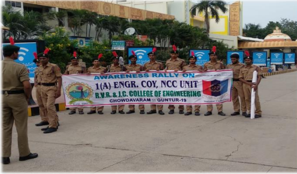
RVR & JC CE, CHOWDAVARAM – 1 (A) ENGR COY NCC, GUNTUR. 23-09-2018 CLEANLINESS DRIVE:RAILWAY STATION - "SWACHHATA HI SEVA"