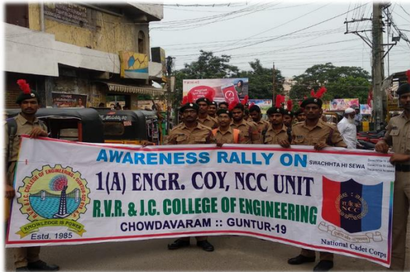
RVR & JC CE, CHOWDAVARAM – 1 (A) ENGR COY NCC, GUNTUR. 26-09-2018 AWARENESS RALLY :ODF - "SWACHHATA HI SEVA"