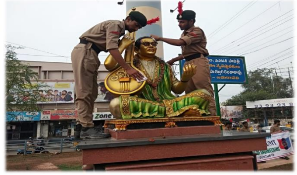
RVR & JC CE, CHOWDAVARAM – 1 (A) ENGR COY NCC, GUNTUR. 20,21-09-2018 CLEANING OF STATUES - "SWACHHATA HI SEVA"