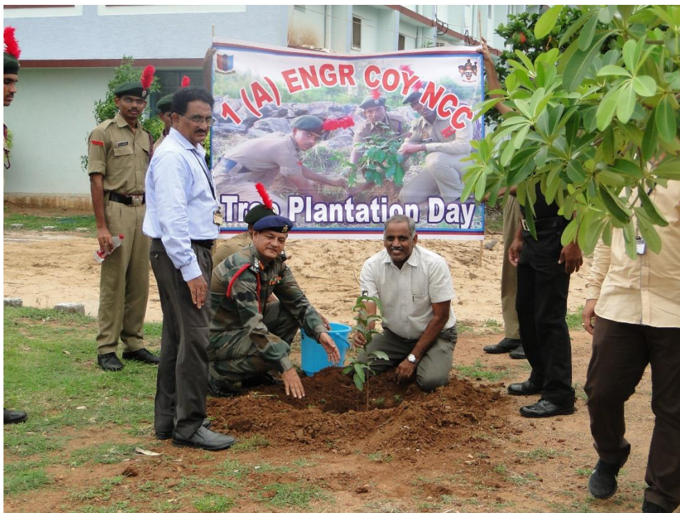
RVR & JC CE, CHOWDAVARAM, - 1 (A) ENGR COY NCC, GUNTUR 01 - 07 - 2019 "TREE PLANTATION"