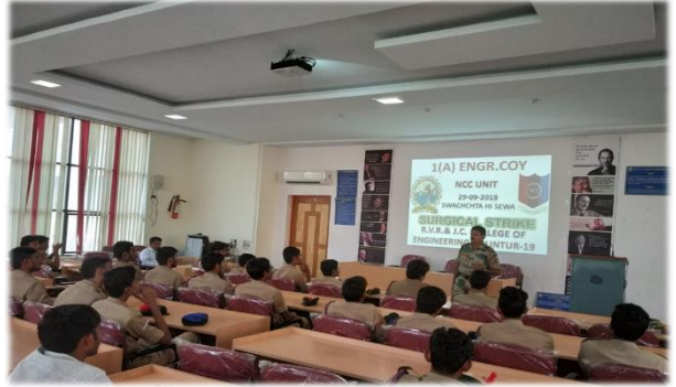
RVR & JC CE, CHOWDAVARAM – 1 (A) ENGR COY NCC, GUNTUR. 29-09-2018 TALK/SPEECH : SURGICAL STRIKE - "SWACHHATA HI SEVA"