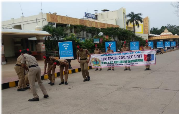
RVR & JC CE, CHOWDAVARAM – 1 (A) ENGR COY NCC, GUNTUR. 23-09-2018 CLEANLINESS DRIVE:RAILWAY STATION - "SWACHHATA HI SEVA"