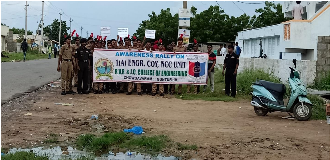
RVR & JC CE, CHOWDAVARAM, - 1 (A) ENGR COY NCC, GUNTUR 26 - 11 - 2019 "WATER CONSERVATION AND RAIN WATER HARVESTING"