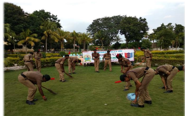
RVR & JC CE, CHOWDAVARAM – 1 (A) ENGR COY NCC, GUNTUR. 25-09-2018 CLEANLNING OF PUBLIC PARKS - "SWACHHATA HI SEVA"