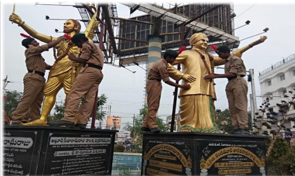
RVR & JC CE, CHOWDAVARAM – 1 (A) ENGR COY NCC, GUNTUR. 20,21-09-2018 CLEANING OF STATUES - "SWACHHATA HI SEVA"