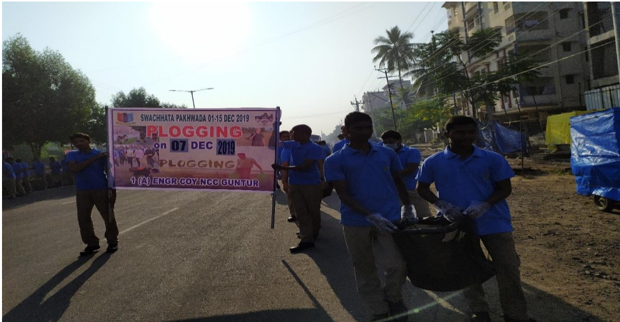
RVR & JC CE, CHOWDAVARAM, - 1 (A) ENGR COY NCC, GUNTUR 07-12-2019 "PLOGGING AND AWARENESS RALLY REGARDING NO USE OF PLASTIC"