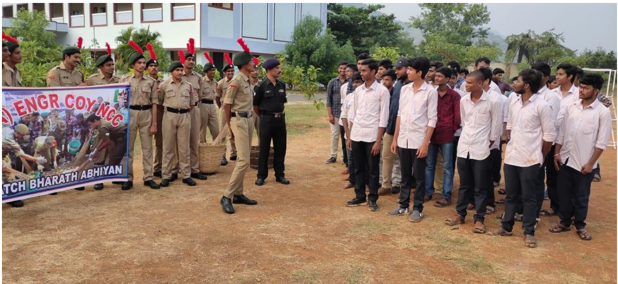
RVR & JC CE, CHOWDAVARAM, - 1 (A) ENGR COY NCC, GUNTUR 13 - 12 - 2019 "AWARENESS PROGRAM ABOUT PLASTIC WASTE MANAGEMENT - SWACH BHARATH ABHIYAN"