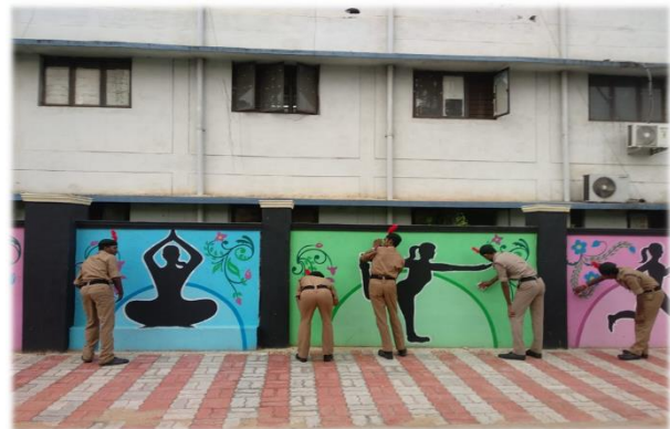
RVR & JC CE, CHOWDAVARAM – 1 (A) ENGR COY NCC, GUNTUR. 22-09-2018 WALL PAINTINGS/CLEANING - "SWACHHATA HI SEVA"