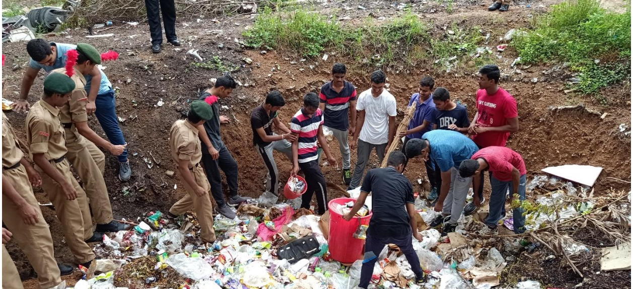
RVR & JC CE, CHOWDAVARAM, - 1 (A) ENGR COY NCC, GUNTUR 20 - 09 - 2019 "SEGREGATION OF WASTE"