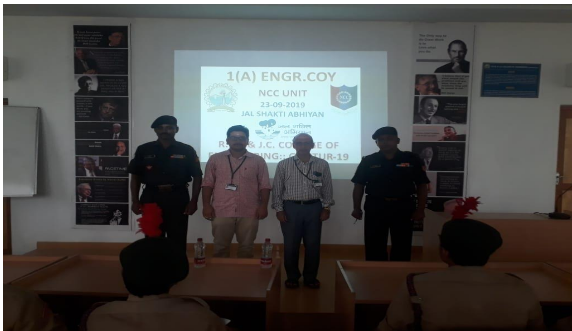
RVR & JC CE, CHOWDAVARAM, - 1 (A) ENGR COY NCC, GUNTUR 23 - 09 - 2019 "SEMINAR ON JAL SHAKTI ABHIYAN"