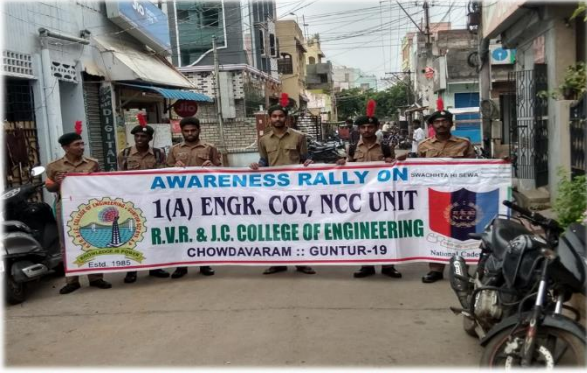
RVR & JC CE, CHOWDAVARAM – 1 (A) ENGR COY NCC, GUNTUR. 26-09-2018 AWARENESS RALLY :ODF - "SWACHHATA HI SEVA"