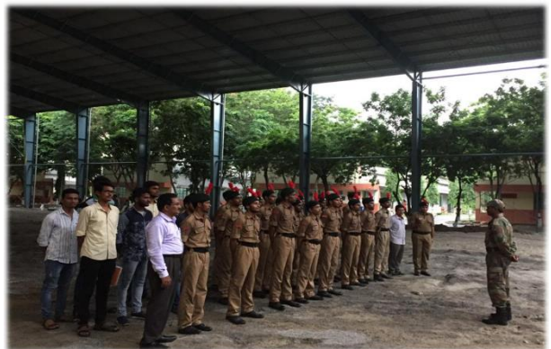
RVR & JC CE, CHOWDAVARAM – 1 (A) ENGR COY NCC, GUNTUR. CONDUCTING NCC PARADES- "SWACHHATA HI SEVA"