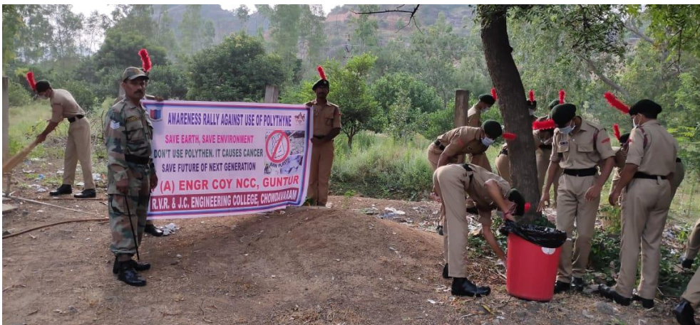
RVR & JC CE, CHOWDAVARAM, 1 (A) ENGR COY NCC, GUNTUR 05 - 11 - 2020 “AWARENESS RALLY AGAINST USE OF POLYTHENE”