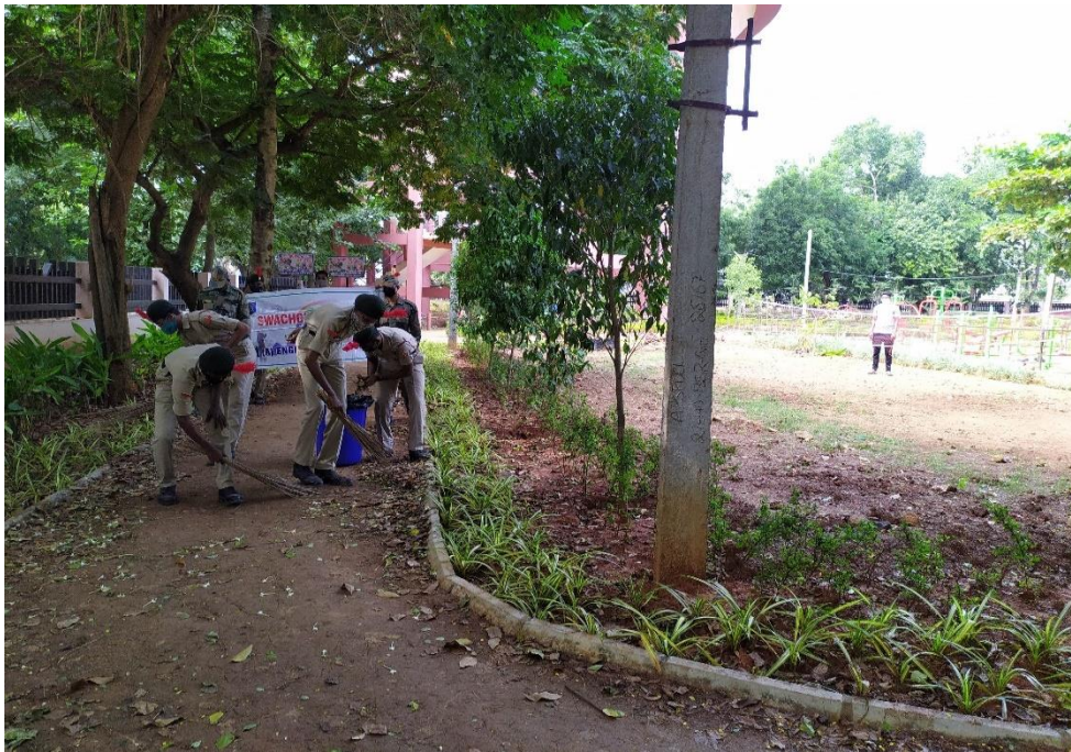
RVR & JC CE, CHOWDAVARAM, 1 (A) ENGR COY NCC, GUNTUR 07 - 12 - 2020 "CLEANING OF PUBLIC PARKS - SWACHHTA HI SEWA"