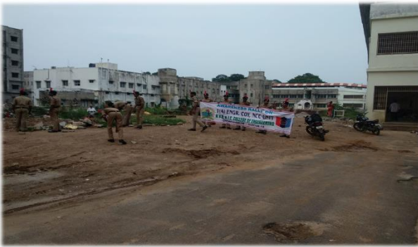
RVR & JC CE, CHOWDAVARAM – 1 (A) ENGR COY NCC, GUNTUR. 19-09-2018 CLEANING OF STREETS, DRAINS - "SWACHHATA HI SEVA"