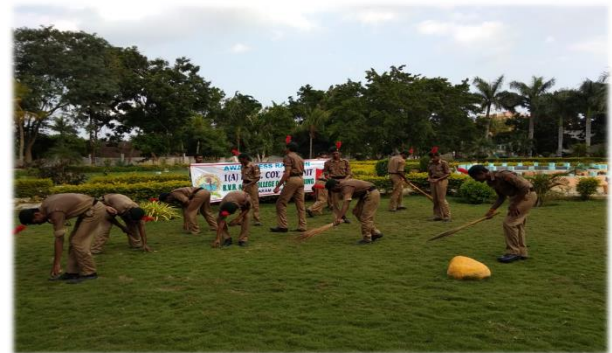
RVR & JC CE, CHOWDAVARAM – 1 (A) ENGR COY NCC, GUNTUR. 25-09-2018 CLEANLNING OF PUBLIC PARKS - "SWACHHATA HI SEVA"