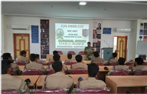
RVR & JC CE, CHOWDAVARAM – 1 (A) ENGR COY NCC, GUNTUR. 29-09-2018 TALK/SPEECH : SURGICAL STRIKE - "SWACHHATA HI SEVA"