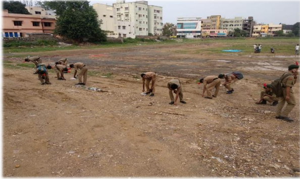
RVR & JC CE, CHOWDAVARAM – 1 (A) ENGR COY NCC, GUNTUR. 19-09-2018 CLEANING OF STREETS, DRAINS - "SWACHHATA HI SEVA"